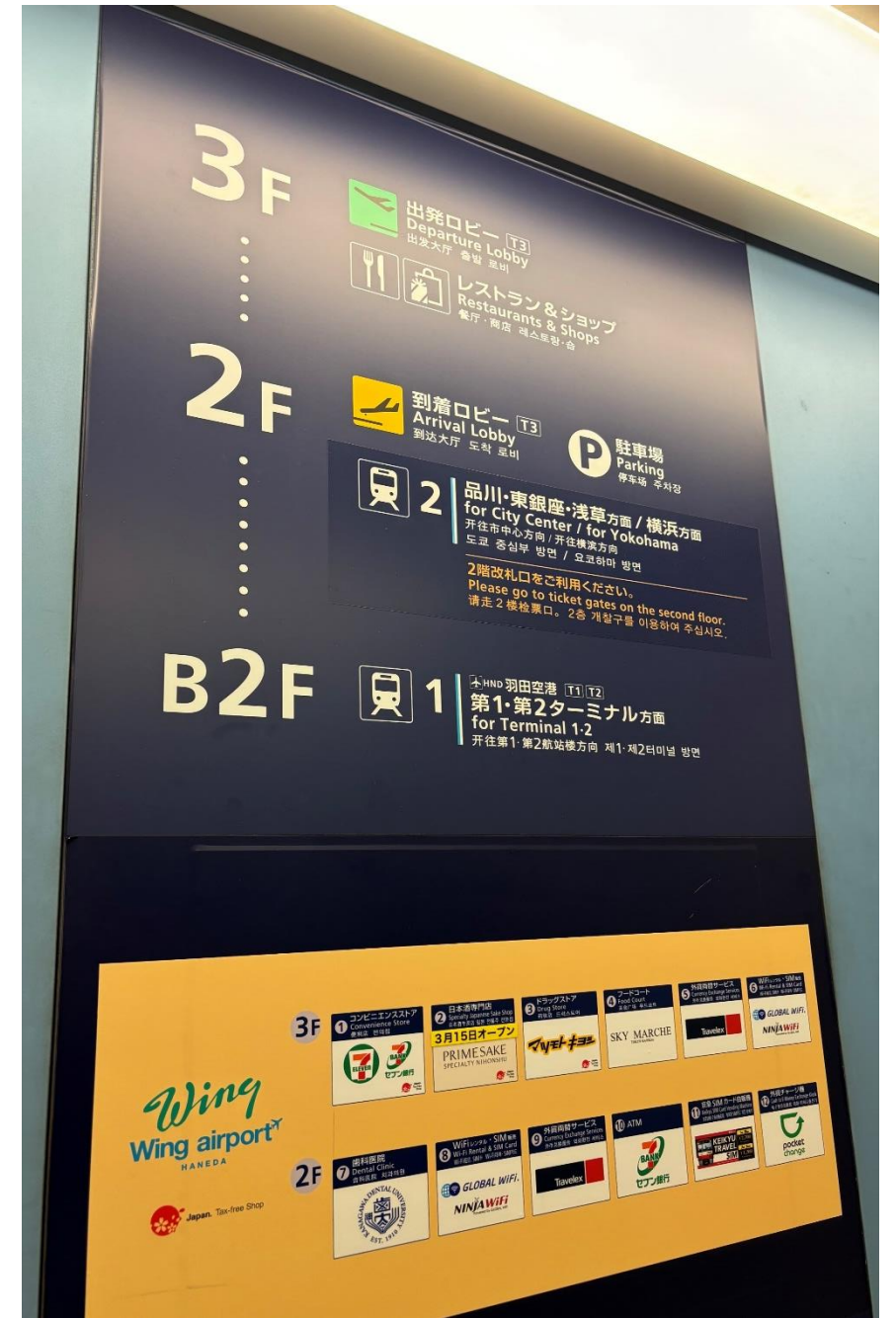
Some photos of Haneda Airport and airport station